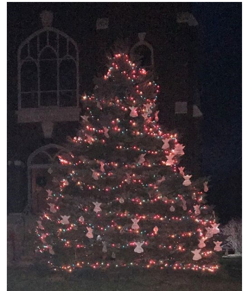
St Paul's Angel Tree

What comes to your mind when you think of "accompanying" others? How can "accompanying" help us today and in the future? Following are some Con't