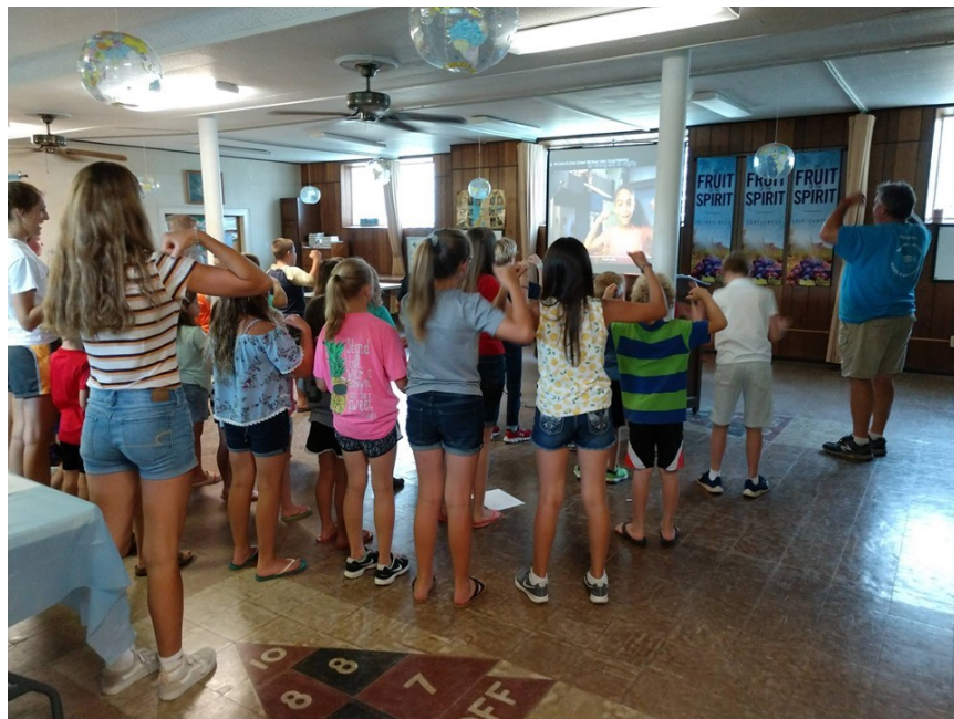
2019 Joint Vacation Bible School