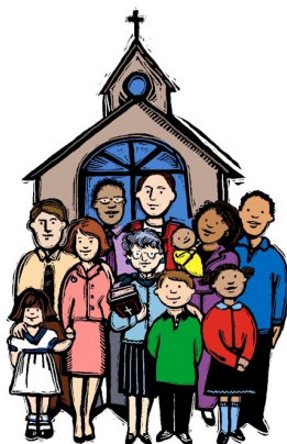
Our Church Family

3 rd – 5 th Wood Turtle Days Sun 5 th Worship 9:00 am Sat 18 th Blood Drive 7:00 am – 12:30 pm Sun 19 th Worship 9:00 am Birthday/Anniversary Fellowship Sun 26 th Worship 9:00 am