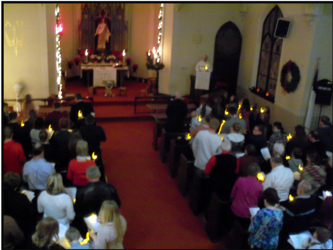
Silent Night, Holy Night